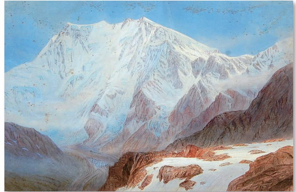
Monte Rosa from the Monte Moro , pencil and watercolour heightened with white bodycolour or gouache, with touches of blue and white pastel. No visible date or signature, 717mm x 1054mm.

He... started soon after daylight, and walked a number of miles, making