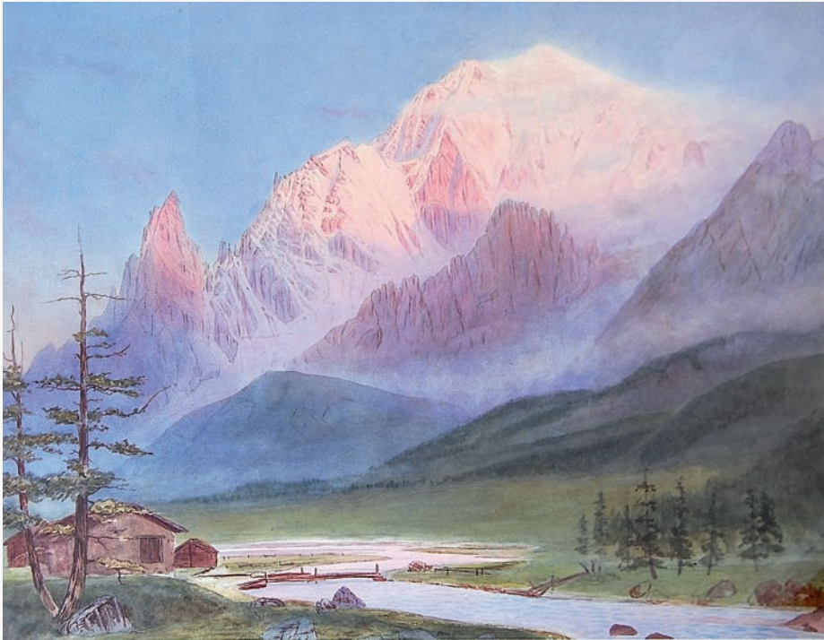
Mont Blanc de Courmayeur , pencil and watercolour. Perhaps c.1879, 690mm x 998mm.

the under-drawing reveals a faint but confidently delineated pencil line that was used as a guide in building up layers of watercolour. The valley floor, by contrast, with its Alpine huts, bridge and stream, are painted in a style at once heavier and sketchier, as if from a sketchbook study or from memory. Moreover, the view of Mont Blanc does not correspond with what is visible from the valley floor near Courmayeur but indicates a much higher vantage point from somewhere on the south-east side of the valley. 12