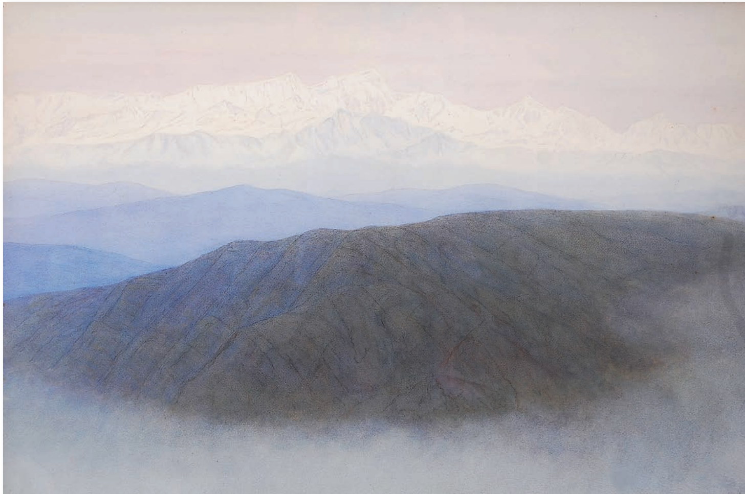
The Mists of Early Summer at Brinsar (?) ; pencil and watercolour. No visible signature or date but probably 1900, 747mm x 1102mm. Back of frame is inscribed 'Moonrise and Afterglow at the Schwarzsee' suggesting that the frame was reused at some point.

the clear light of mid-morning after the mountain forms had been drawn out in some considerable detail. Pencil marks are visible on the surface of the paper where they were painted around in Chinese white or body colour, creating the forms of the mountains and allowing the surface of the paper, which has since yellowed somewhat, to show through. A work of uncertain title, but possibly The Mists of Early Summer at Brinsar , is a most subtle painting – an infinitely soft and somewhat indistinct panorama of the Himalaya near Almora, in which the vast intervening space is treated as waves of colour, enabling the eyes (as one critic of the time noted) 'to do what the eyes of the traveller do – fasten at once on the centre and object of his design, the mystic mountain range.' 19