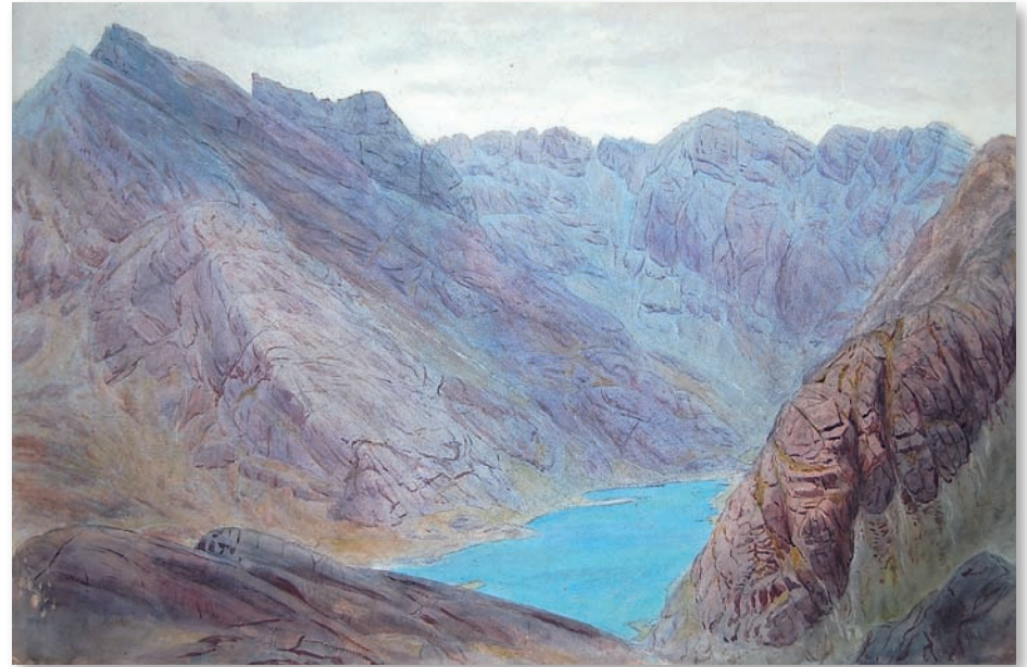
Study of Loch Coruisk from the Shoulder , pencil and watercolour, 1888. Signed on reverse in ink with date and title, 638mm x 958mm.