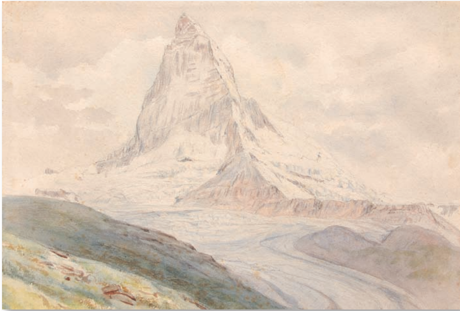
The Matterhorn from Zermatt , pencil and watercolour. Inscribed 24 June 1865 on reverse – just three weeks before Edward Whymper's first ascent.