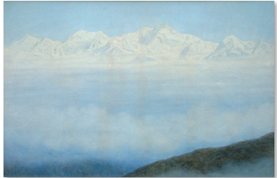
November morning at Darjeeling, showing, Jannu, Kabru, Kangchenjanga & Pandim . Pencil, watercolour and bodycolour. Signed on label on reverse of frame, 1900, 762 x 1016mm.